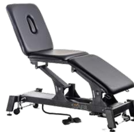
Stabil 3-Section Electric - Black Frame 250Kg CODE: 1003U-65BB