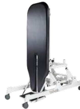
Stabil Tilt Table Electric - White Frame / Navy Upholstery 225Kg CODE: 1030U