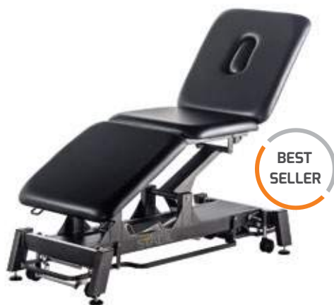
Stabil 3-Section Electric – I-TOUCH 360° Operation- Black Frame 250Kg CODE: 1003U-65BB-AR