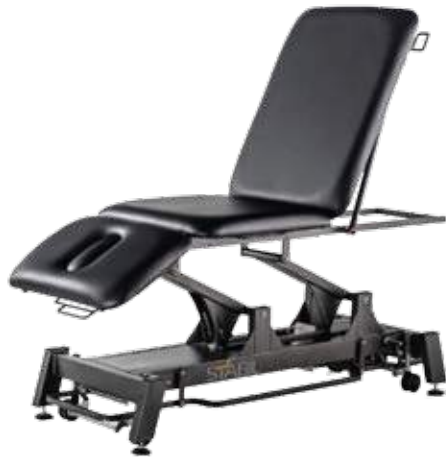
Stabil 3-Section Shorthead Electric - I-TOUCH 360° Operation - Black Frame 250Kg CODE: 1004U-65BB-360