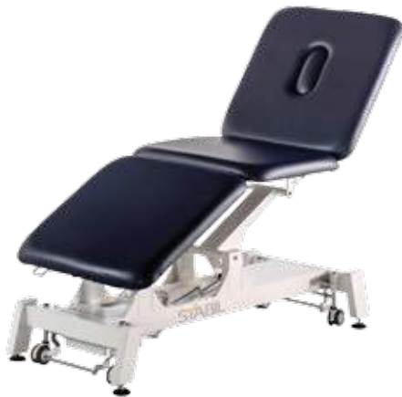
Stabil 3-Section Bariartic Table Electric - White Frame / Navy Upholstery 320Kg CODE: 1010B