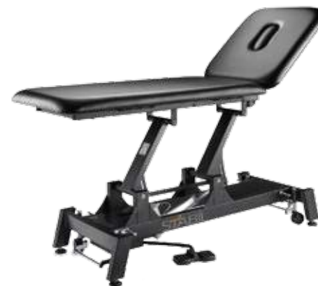
Stabil 2-Section Electric - Black Frame 250Kg CODE: 1002U-65BB