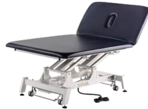
Stabil 2-Section Bobath Neurological Table 1.2M Electric - White Frame / Navy Upholstery 320Kg CODE: 1020U-WN