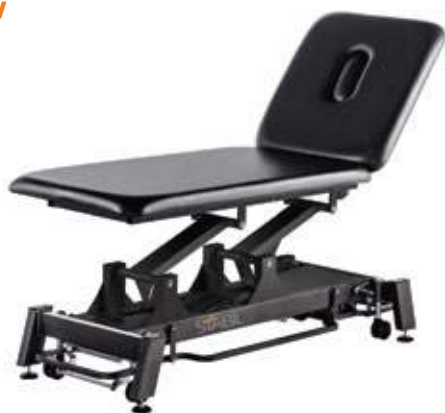
Stabil 2-Section Electric – I-TOUCH 360° Operation- Black Frame 250Kg CODE: 1002U-65BB-AR